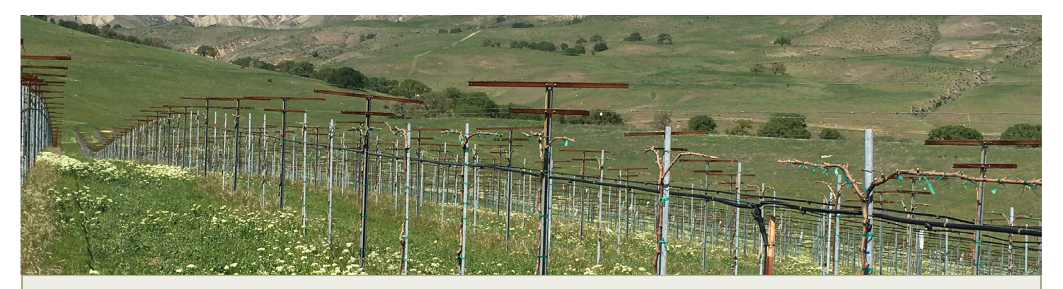
Paicines Ranch grows cover crops in their vineyards, not only to build soil carbon and feed soil biology, but also to provide forage for sheep which are brought in to graze the cover crop.