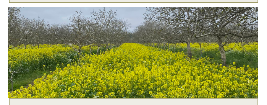
A field of mustard grows tall in between the walnut trees at Double A Farms. Here the mustard is used to help suppress plant-parasitic nematodes.