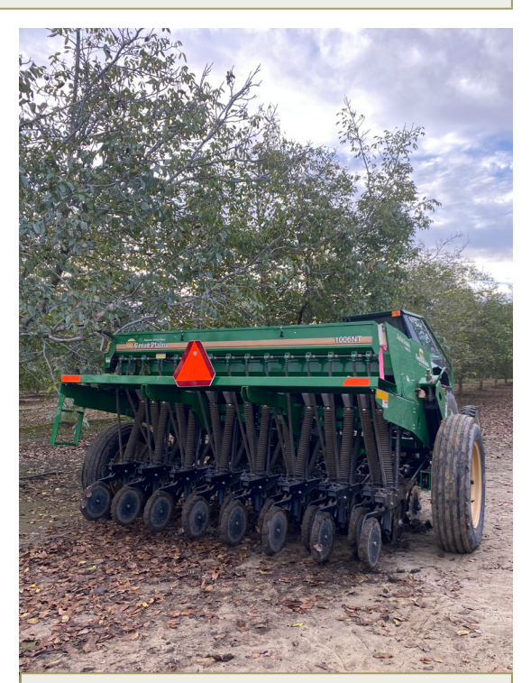
Cover crops are typically planted either with a seed drill or by broadcasting the seed. At River Garden Farms, they plant with a Great Plains no-till seed drill which allows them to plant cover crop seed with little to no soil preparation or disturbance.