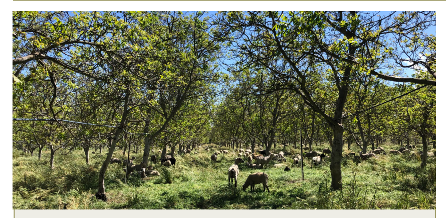
Sierra Orchards brings in sheep every year to graze in their organic walnut orchards in order to help manage their cover crop while simultaneously enhancing benefits to the soil.