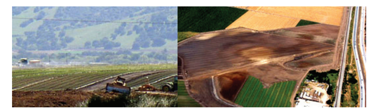
Bulldozing a twenty-acre lake (left) near Salinas, CA to keep food safety auditors happy cost the farmer plenty to carry out. Now it is costing more with water agencies requiring that the denuded lake (right) be restored.

As understanding has increased regarding the prevalence of pathogens in wildlife and the pathways by which pathogens may move, it has become clear that the initial measures taken following the outbreak should be reconsidered. The concerns regarding wildlife created by some food safety metrics have been hard to dispel. At times these they have led to rigid application of conservation-threatening metrics in crops that present minimal to no food safety risk. Such a misguided focus on wildlife in food safety regulation has led to the removal of conservation measures that could actually benefit food safety, with little thought to the ecosystem services and public health benefits these features provide.