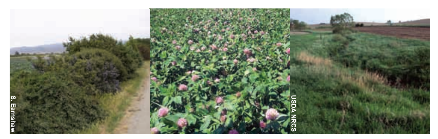
What do hedgerows, cover crops, and grassed waterways have in common? Food safety!

Long before 2006, when E. coli O157:H7 made its way into packaged fresh-cut spinach—killing five people and sickening more than two hundred—food safety auditors were on Salinas Valley, California, farms. The E. coli outbreak was not a new phenomenon. Numerous such incidents had occurred since 1993. But the deaths and large numbers of people sickened by the produce in 2006 generated a strong response from the produce industry and the Food and Drug Administration (FDA). Response to a broad FDA Consumer Advisory effectively shut down spinach sales, causing large financial losses in spinach and other sectors of the produce industry. The handlers within the industry responded by creating the California (and later Arizona) Leafy Green Products Handler Marketing Agreements (LGMA), which require participating leafy greens handlers to ensure that their farm suppliers are practicing Good Agricultural Practices (GAPs) that the Agreements define.