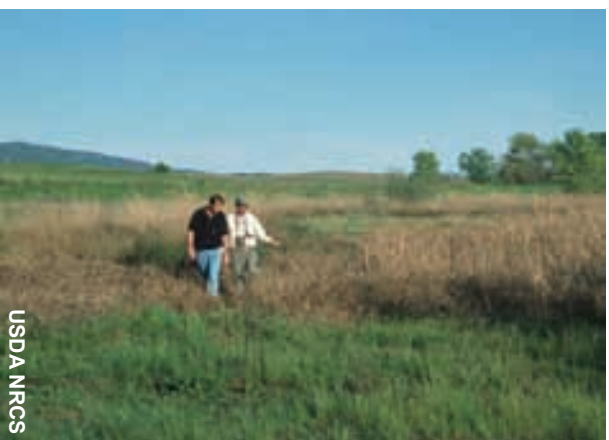
Native hedgerows and restored wetlands can create safe benefits, such as predator and pollinator habitat, dust and erosion control, and pathogen filtration.