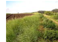
Grass forms part of this hedgerow.