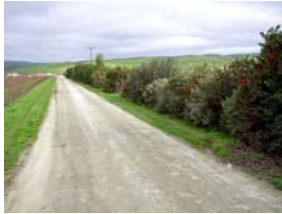
A mature hedgerow.